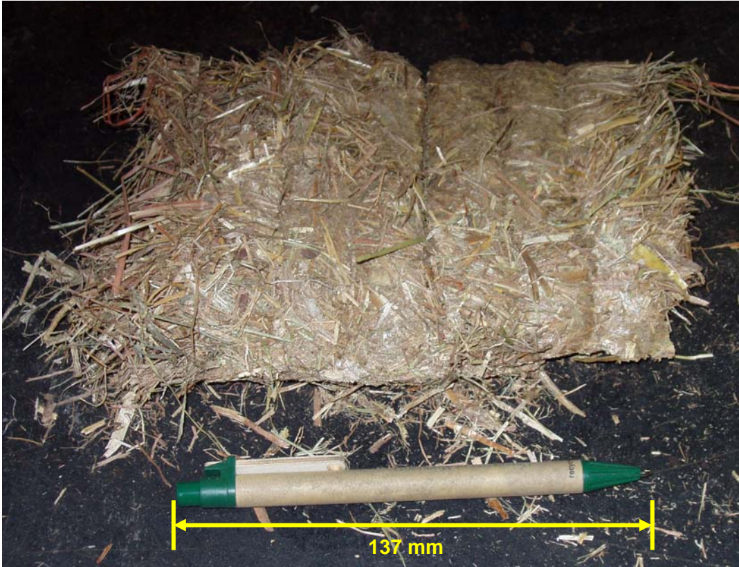
Figure 3. Roll press compacted native perennial grasses. The native perennial grass particles were obtained using a 203.2 mm (8.0 in.) screen in the tub grinder.