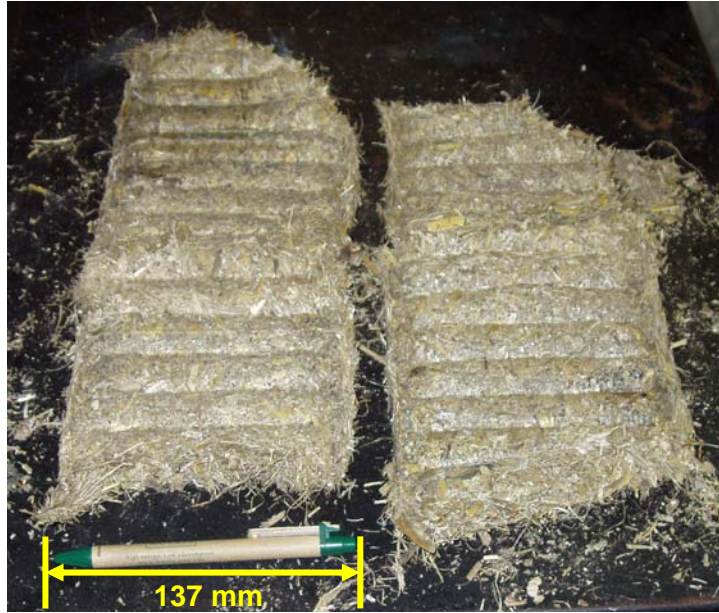
Figure 1. Roll press compacted corn stover. The corn stover particles were obtained using a 19.1 mm ( \frac{3}{4} in.) screen in the tub grinder.